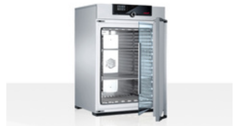
A Memmert Generation 2012 incubator

As early as in the Middle Ages, Bavarian beer brewers were punished severely if they tried to sell adulterated, insufficiently stored or contaminated beer. In Nuremberg, such beer was disposed of in the river Pegnitz and in Regensburg, where the city doctor was in charge of supervising the beer quality, the brewer was in the worst