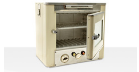
An old Memmert TV10 from 1975