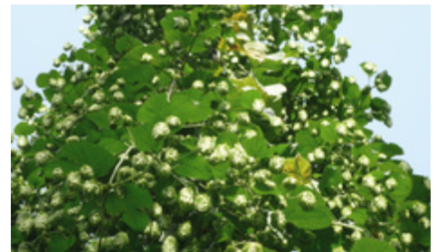
Hops is one of three ingredients the purity law allows

The beer samples are subject to continuous screening for beer-spoiling microorganisms over the entire production process. For this purpose, an incubator INE 550 and a hot air steriliser SFE 550 made by Memmert are almost permanently in use in the laboratory of the Schönram brewery. In the incubator , the bacteria are incubated at 27