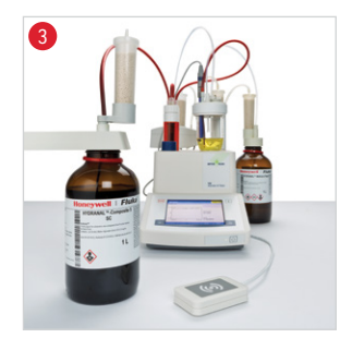
Sync data into the system.