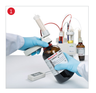
Connect the reagent to the equipment.

By holding the bottle with the new label against the RFID reader of your Mettler Toledo instrument (see process diagram), the data are automatically transferred to your titrator.