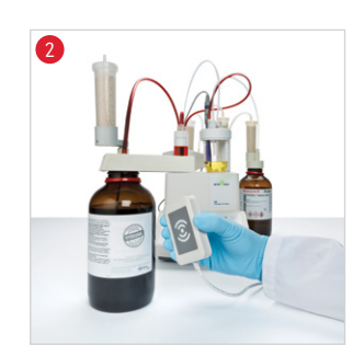
Read SmartLabel data. Hold the reader next to where the SmartLabel is placed, underneath the original Hydranal stamp.