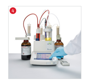
Start the analysis. Start your test with just one click.

Contact your local sales representative to place your order.