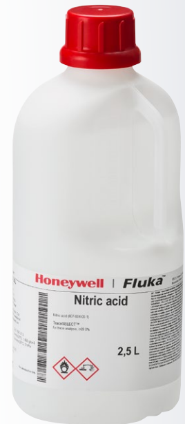
Honeywell Fluka - Nitric Acid TraceSELECT 84385-2.5L

For more information, visit: lab.honeywell.com/traceselect