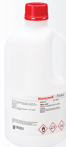
Honeywell Fluka - Nitric Acid TraceSELECT 84385-2.5L

The reduction of metals into mercury is more favourable than reduction to the solid-state electrode. Further on there is always a clean new Hg electrode surface available for each measurement.