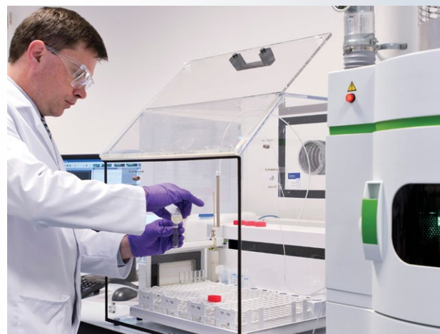
Atomic Emission Spectroscopy Analysis

With Honeywell's analytical reagents, superior quality and safety standards are a prime focus. We use a comprehensive Quality Assurance System in line with EN 29001 (ISO 9001) and each of our products is manufactured to clear, guaranteed specifications. We employ a large variety of modern analytical methods, such as inductively coupled plasma optical emission spectroscopy (ICP-OES), inductively coupled plasma mass spectrometry (ICP-MS), flame atomic absorption spectroscopy (AAS) and graphite furnace AAS (GF-AAS). This allows for specifically tailored control and analysis procedures for each product.