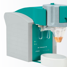
Multi-mode Electrode (MME)