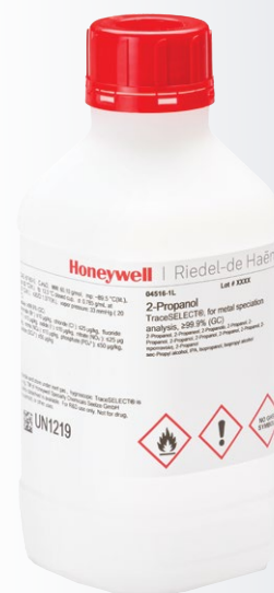
Honeywell Riedel de Haën - 2-Propanol TraceSELECT 04516-1L

The elemental response is usually independent of species, so it is often possible to quantify a species even when its structure is unknown (assuming good HPLC recovery). Identification, however, is based solely on retention time matching. Therefore, a compound in the sample can be identified only by comparison with a standard.